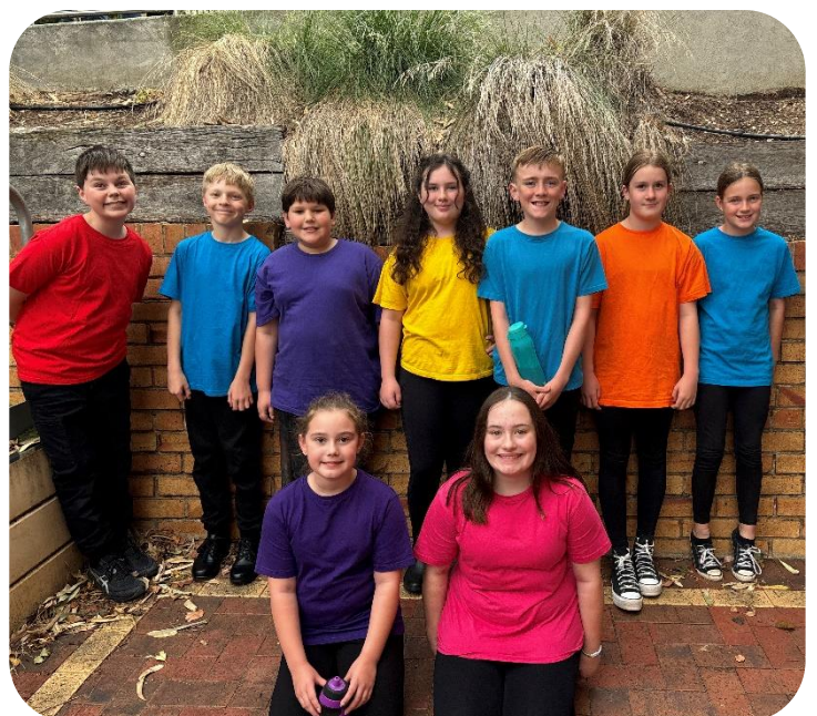
Our JPS Choir group at the Regional performance